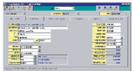
Job Entry / Edit Screen

Mobile Add-on: mJobTime Product Add-on: Time Tracker Web Based Add-on: eJobTime Can be integrated with: ServQuest